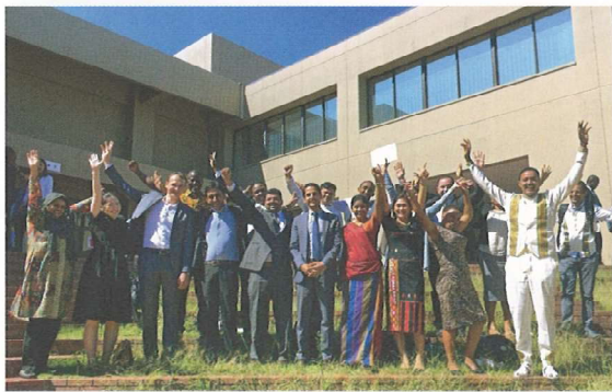
A previous PEPP cohort celebrate arriving on campus following their matriculation ceremony